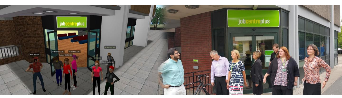
Hao2.eu is a Cyber Essentials & Business Professional Certified Member of TechUK, trade association for the UK IT Industry.

<u>www.hao2.eu</u> <u>www.3DNovations.co.uk</u> <u>www.3DCampus.co.uk</u> <u>www.autus.org.uk</u>